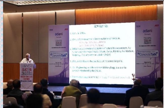
Audience present during the technical lecture.